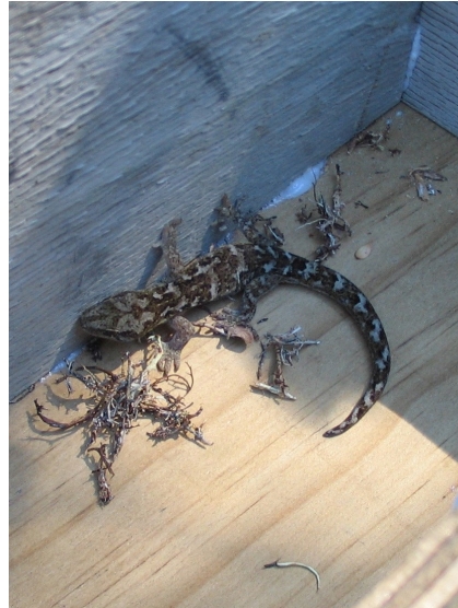
A live gecko recently found on Rona Island