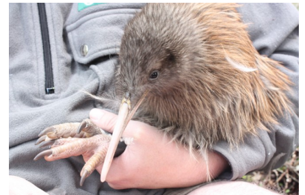
First kiwi destined for Pomona Island