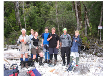
College students with regular volunteers at the end of the bird count on Pomona

Towards the end of 2011, the Trust was fortunate to be able to call on the services of some of the students at Fiordland College to help us with our regular bird counts on Pomona. Back in May, a number of College students completed DOC's 5-minute bird count course and were in need of some field practice. Four lads spent a day on Pomona in November alongside four regular volunteers. Their younger ears were quickly attuned to the different bird calls and they were